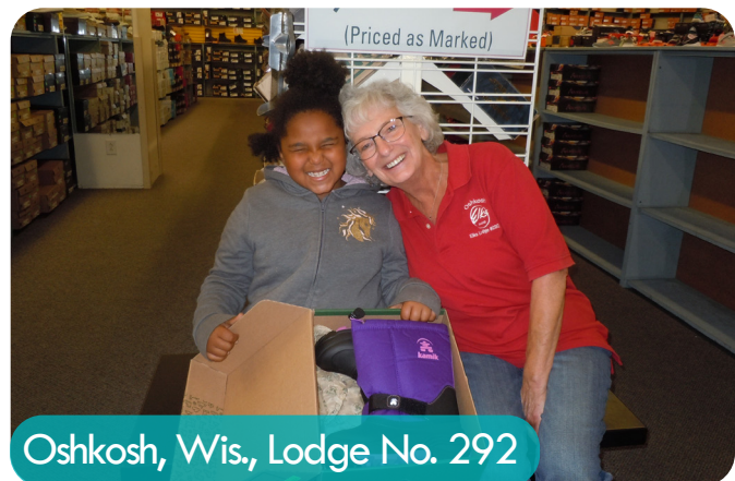
Oshkosh, Wis., Lodge No. 292

Apply as soon as possible to make the biggest impact on your community!