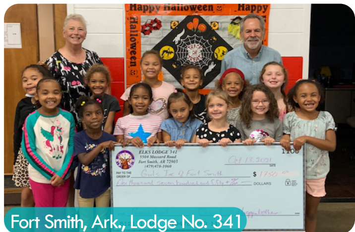
Fort Smith, Ark., Lodge No. 341

Organizations do not have to send you receipts for what they purchased with the grant funds if your Lodge donated directly.