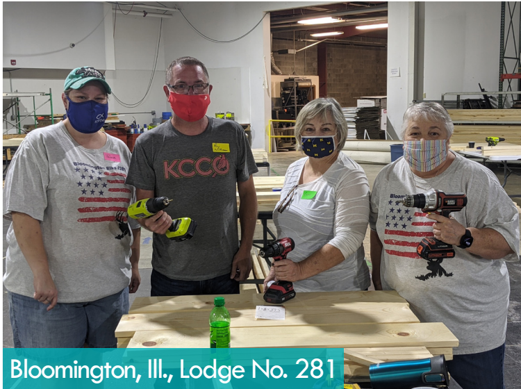
Bloomington, Ill., Lodge No. 281