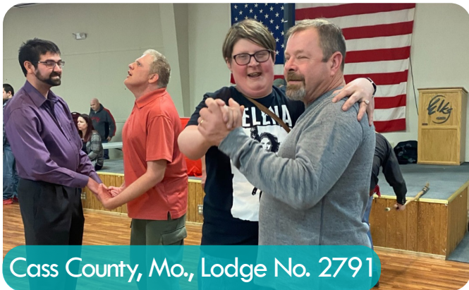
Cass County, Mo., Lodge No. 2791