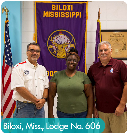
Biloxi, Miss., Lodge No. 606