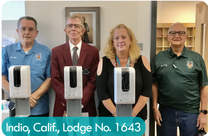
Indio, Calif., Lodge No. 1643

The pandemic forced communities to adapt, and Beacon Grants were no different. In 2022-23, the Beacon Grant will be offered to every Lodge with the flexibility to provide more opportunities to assist communities as we learn to live with COVID-19.