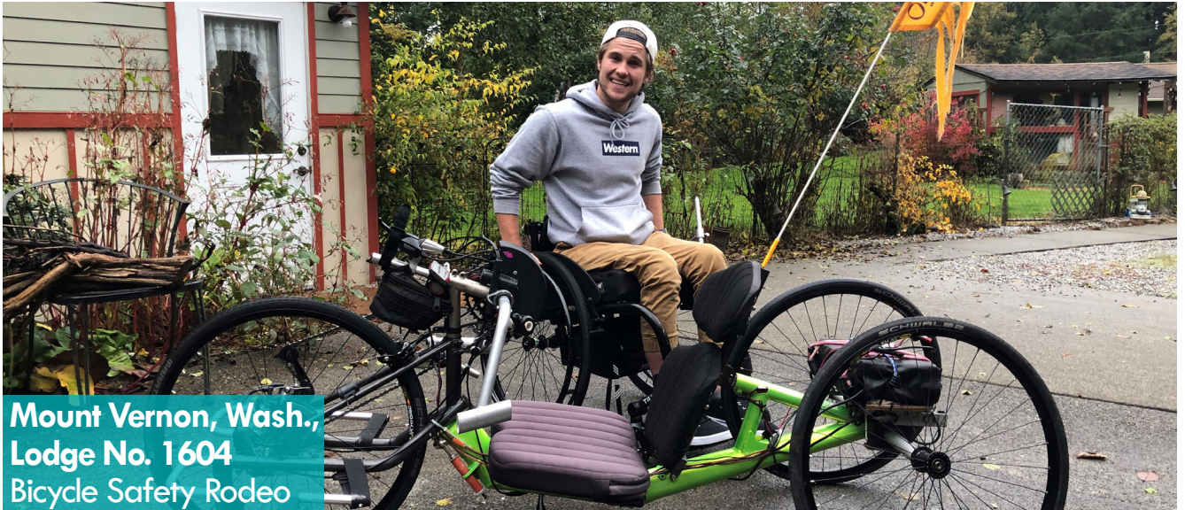
Mount Vernon, Wash., Lodge No. 1604 Bicycle Safety Rodeo