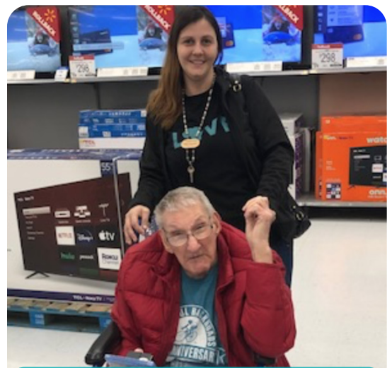
Cartersville, Ga., Lodge No. 1969