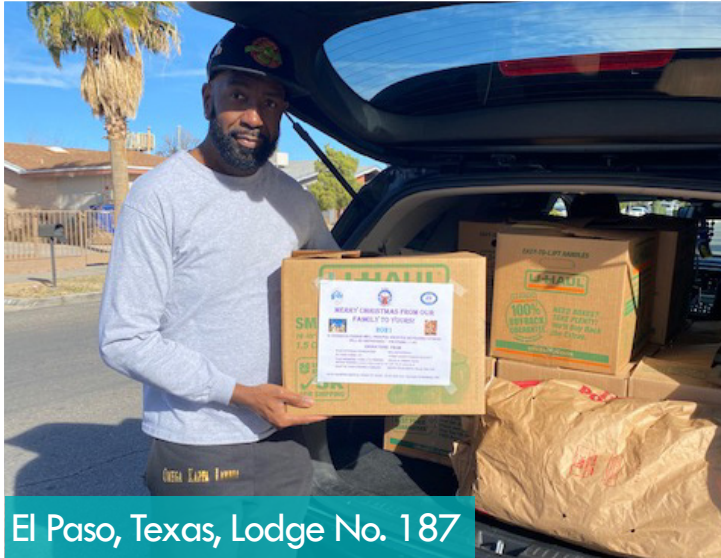
El Paso, Texas, Lodge No. 187