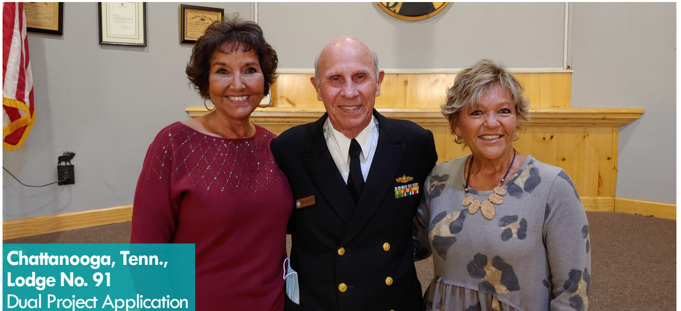
Chattanooga, Tenn., Lodge No. 91 Dual Project Application