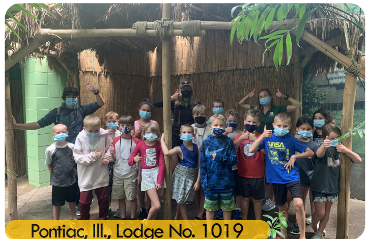
Pontiac, Ill., Lodge No. 1019

Make sure you do not put any receipts, especially checks, in the photos section of the Final Report. Submitted photos are open to the public.