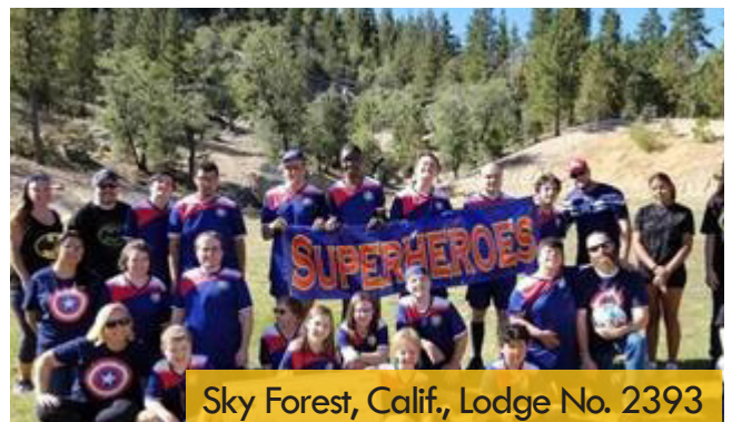
Sky Forest, Calif., Lodge No. 2393

Host a dinner at the Lodge for the athletes! Lodge members can also assist with sporting events by working registration or providing snacks for the athletes and spectators. Going beyond a financial donation will be rewarding both for the athletes and for the Elks who can personally see the project's impact.