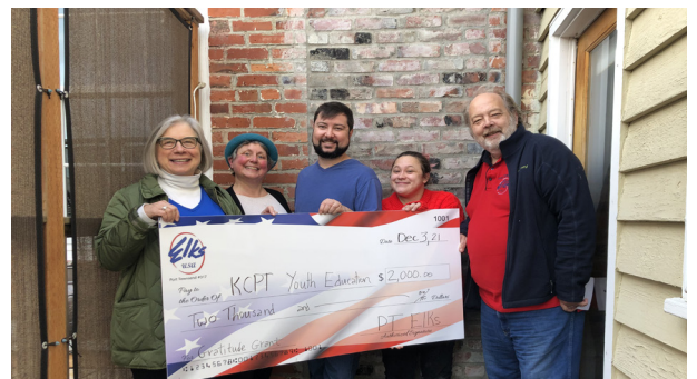
Port Townsend, Wash., Lodge No. 317 donated its Gratitude Grant to a local children's theater program.

At the end of the school year or program cycle, hold an exhibition or performance night at the Lodge celebrating and exhibiting the artwork. It is a great way to show members the role the Lodge can play in the community and encourages students to be proud of their work.