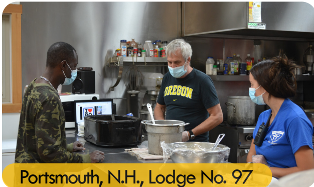
Portsmouth, N.H., Lodge No. 97

Lodges have 30 days after the date of grant completion to submit the Final Report. The end date of a grant is specified by the Grants Coordinator in the application. Need an extension? Contact us!