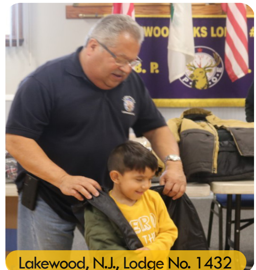
Lakewood, N.J., Lodge No. 1432

Receipts too long? Cut them legibly in half and scan them side by side!