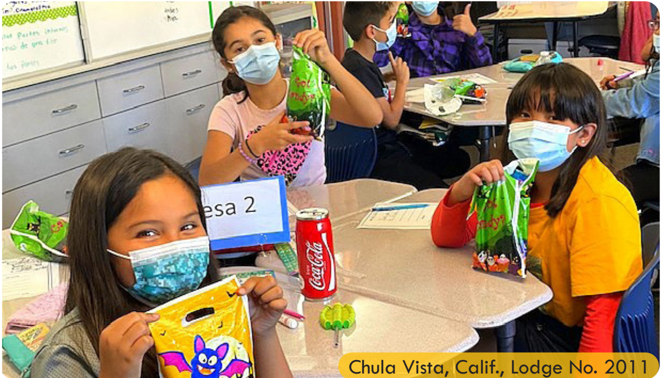
Chula Vista, Calif., Lodge No. 2011

Gratitude Grants are the ENF's way of saying thank you to every Lodge that meets the GER's per-member-giving goal to the ENF. These $2,000-$3,500 grants offer an opportunity for Elks to think about how best to serve and strengthen their communities. Start planning today!