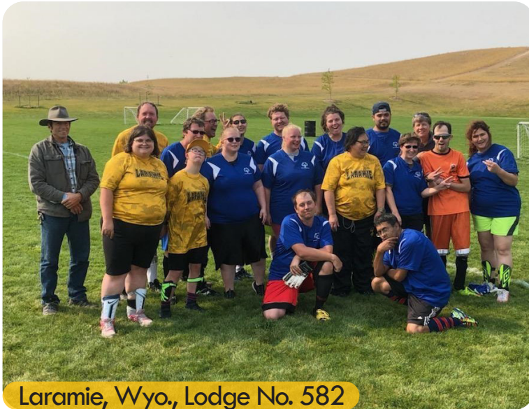
Laramie, Wyo., Lodge No. 582