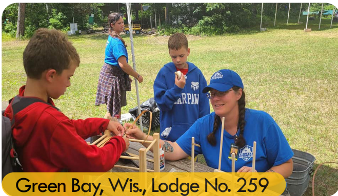
Green Bay, Wis., Lodge No. 259