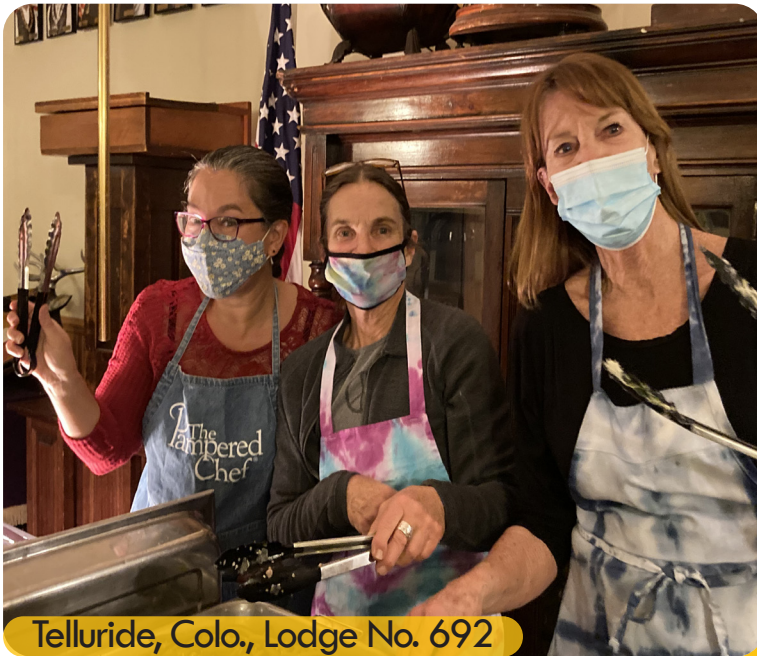
Telluride, Colo., Lodge No. 692