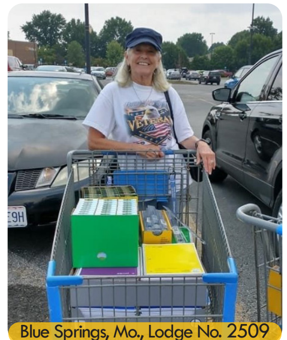
Blue Springs, Mo., Lodge No. 2509