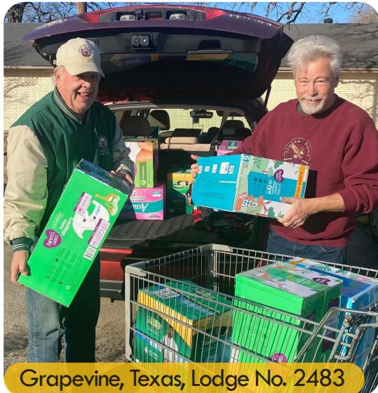
Grapevine, Texas, Lodge No. 2483

Made a donation? For a receipt, we need either a copy of the cashed check, which can be obtained from your bank, or a thank you letter from the organization on an official letterhead with the date and amount donated specified.